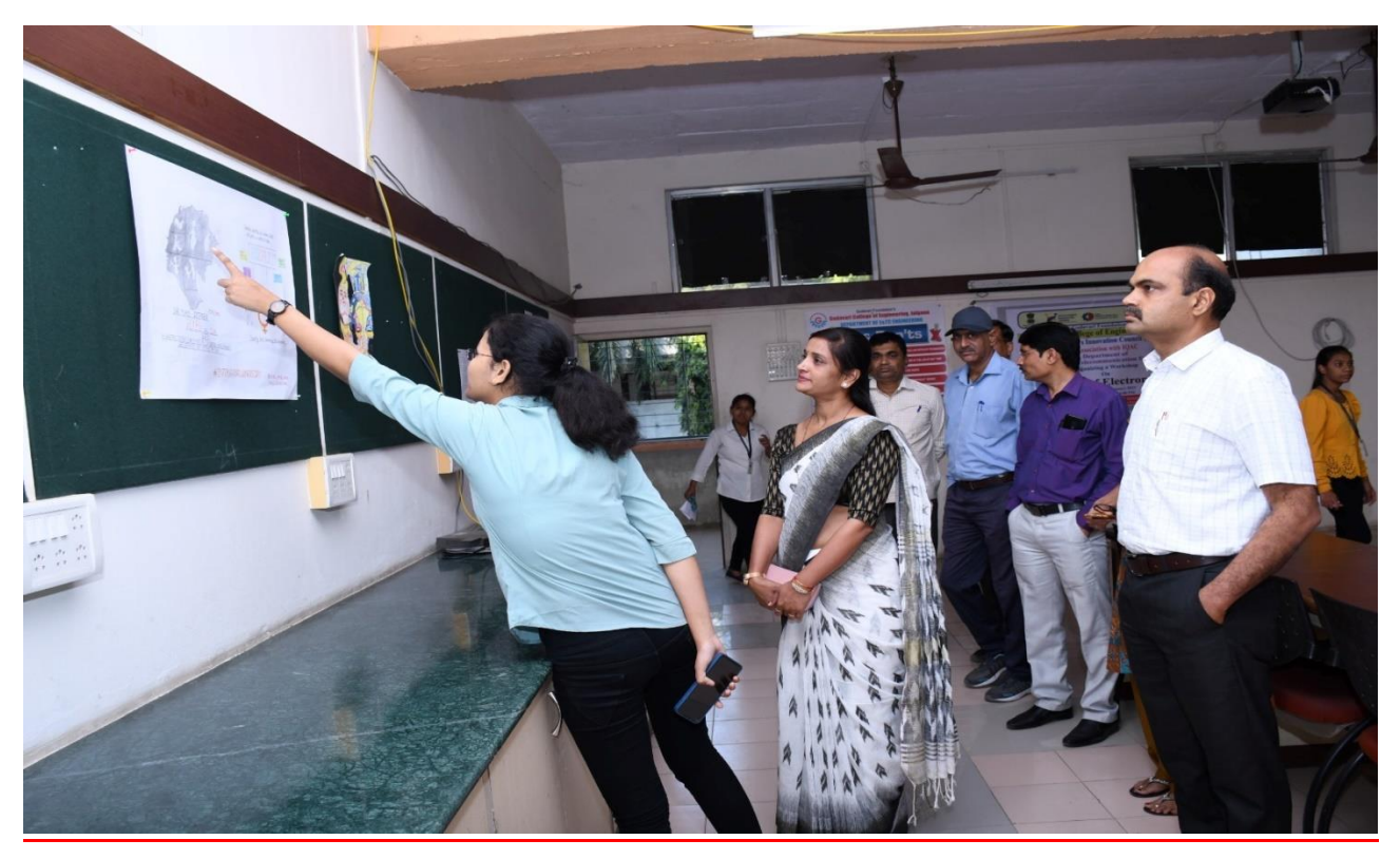
Poster competitions Photo