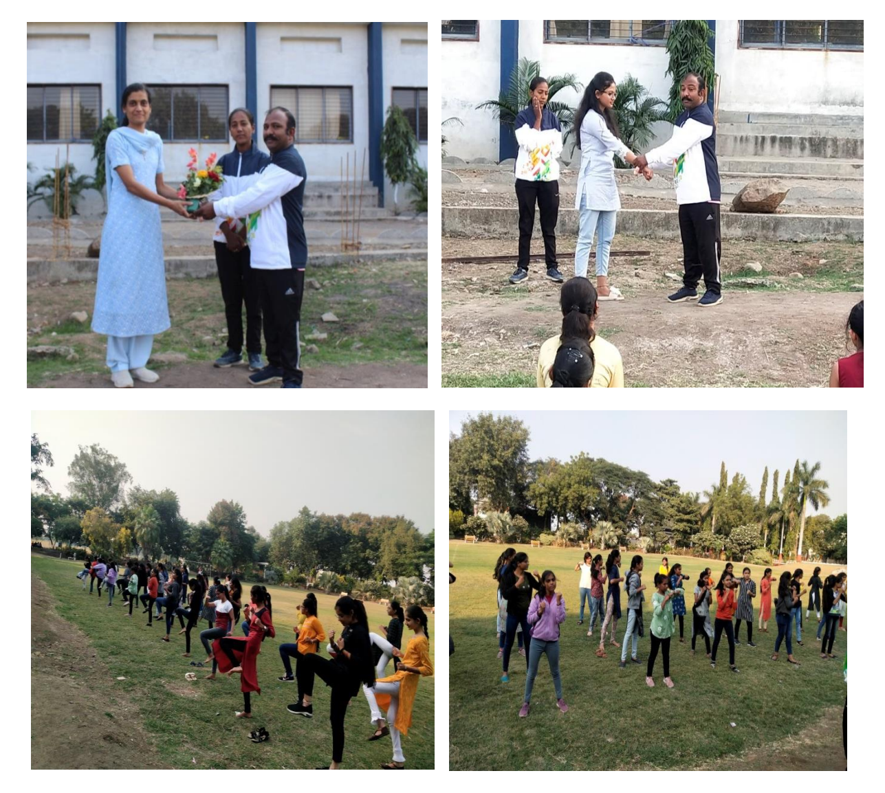
"Gender Sensitization and Human Rights"