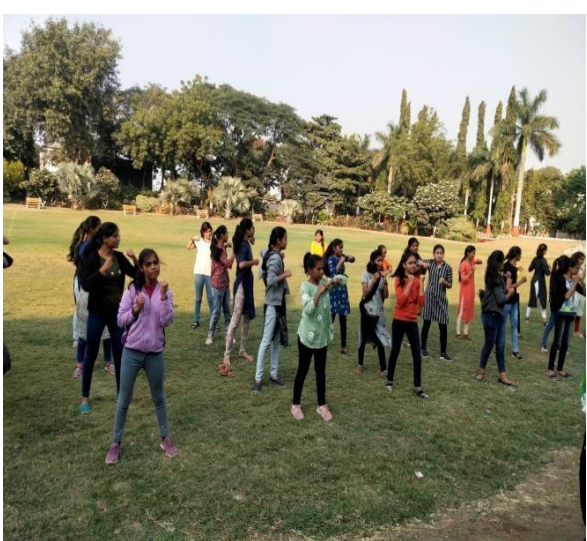
"Gender Sensitization and Human Rights"