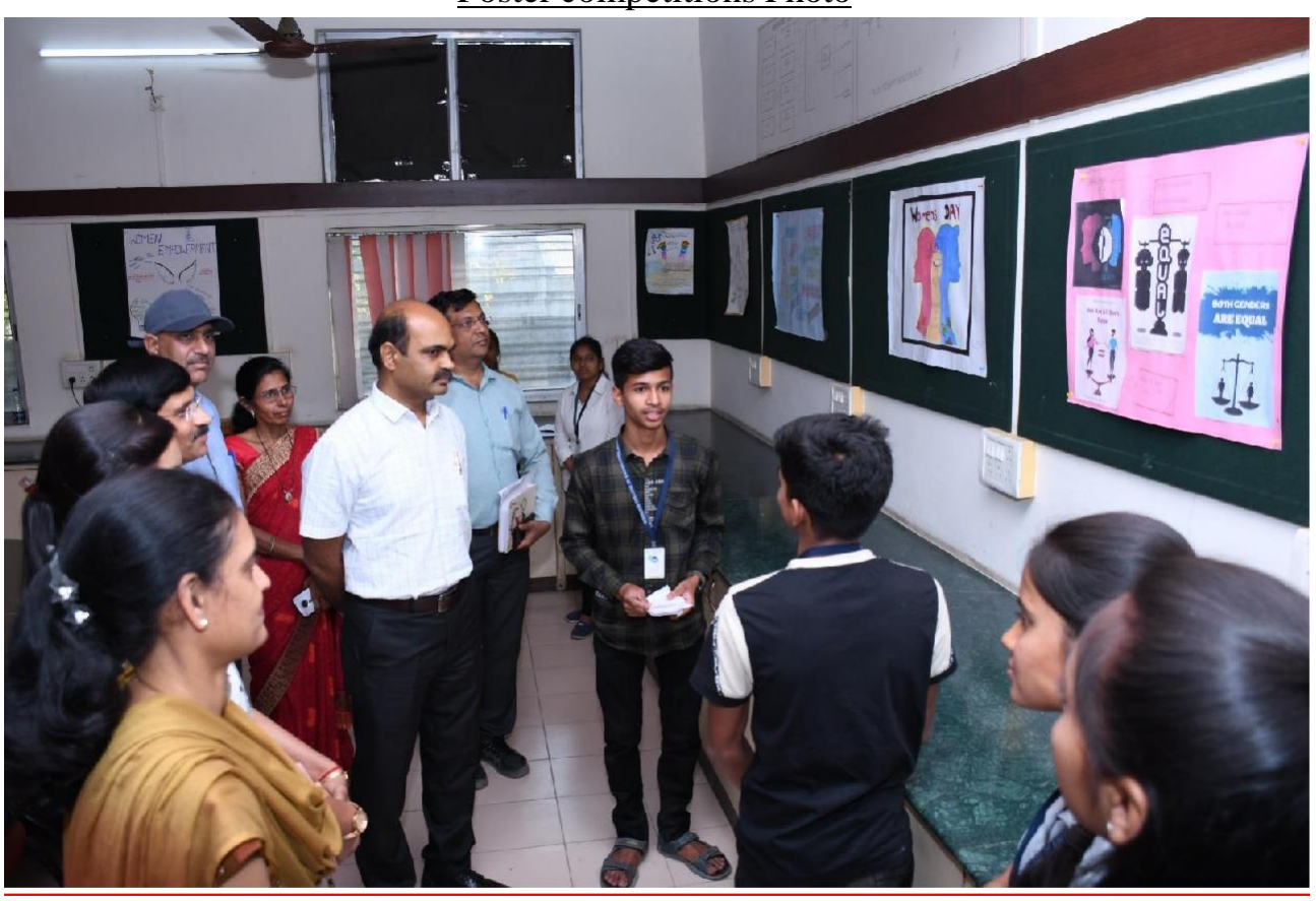
Poster competitions Photo